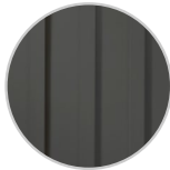
Siding 2 (Optional)