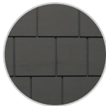
Siding 3 (Optional)